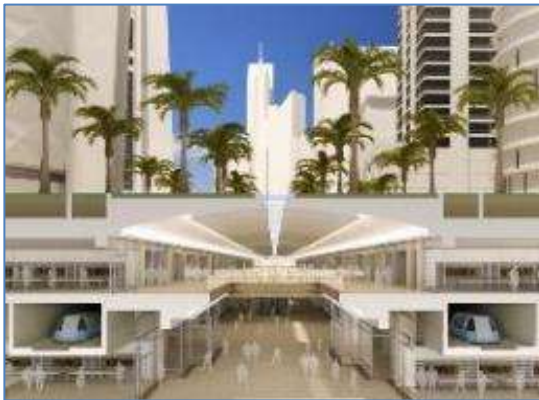
DIFC Retail Spine, UAE