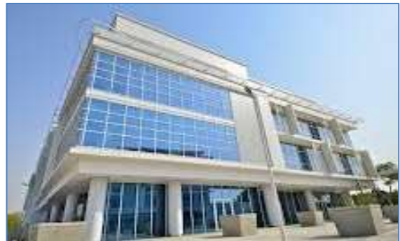
Business Park, Meydan, UAE