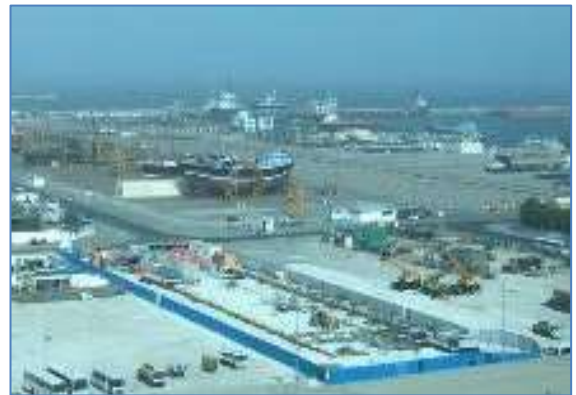
Yard Refurbishment, DMC, UAE