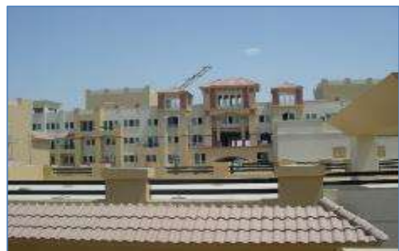
Knowledge Village, Dubai, UAE