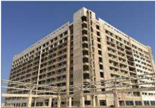
Staff Accommodation, DMC, UAE