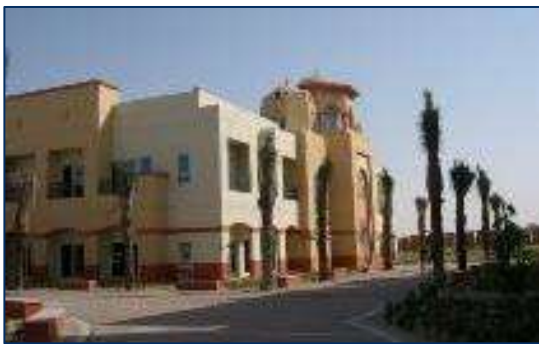
Academic City, Dubai, UAE