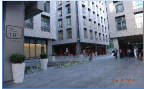
The Gate Village, DIFC, UAE